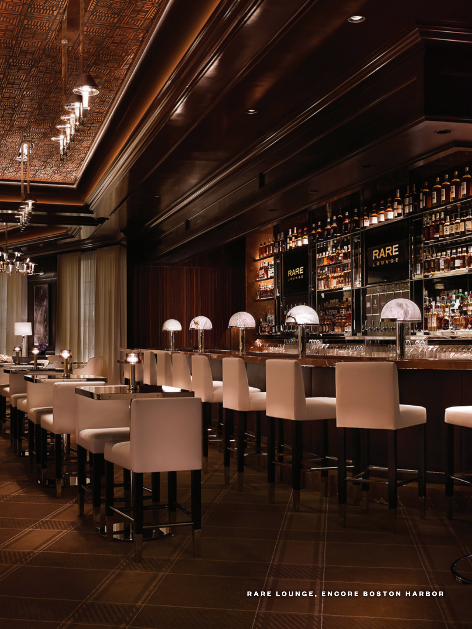
RARE LOUNGE, ENCORE BOSTON HARBOR