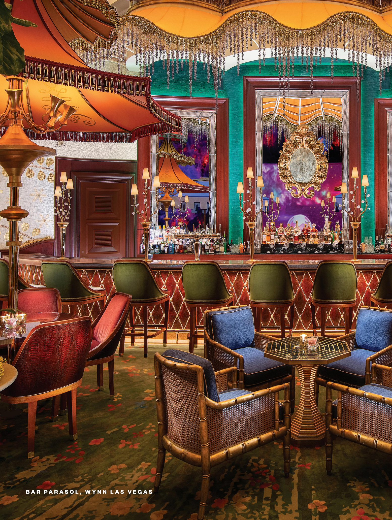
BAR PARASOL, WYNN LAS VEGAS