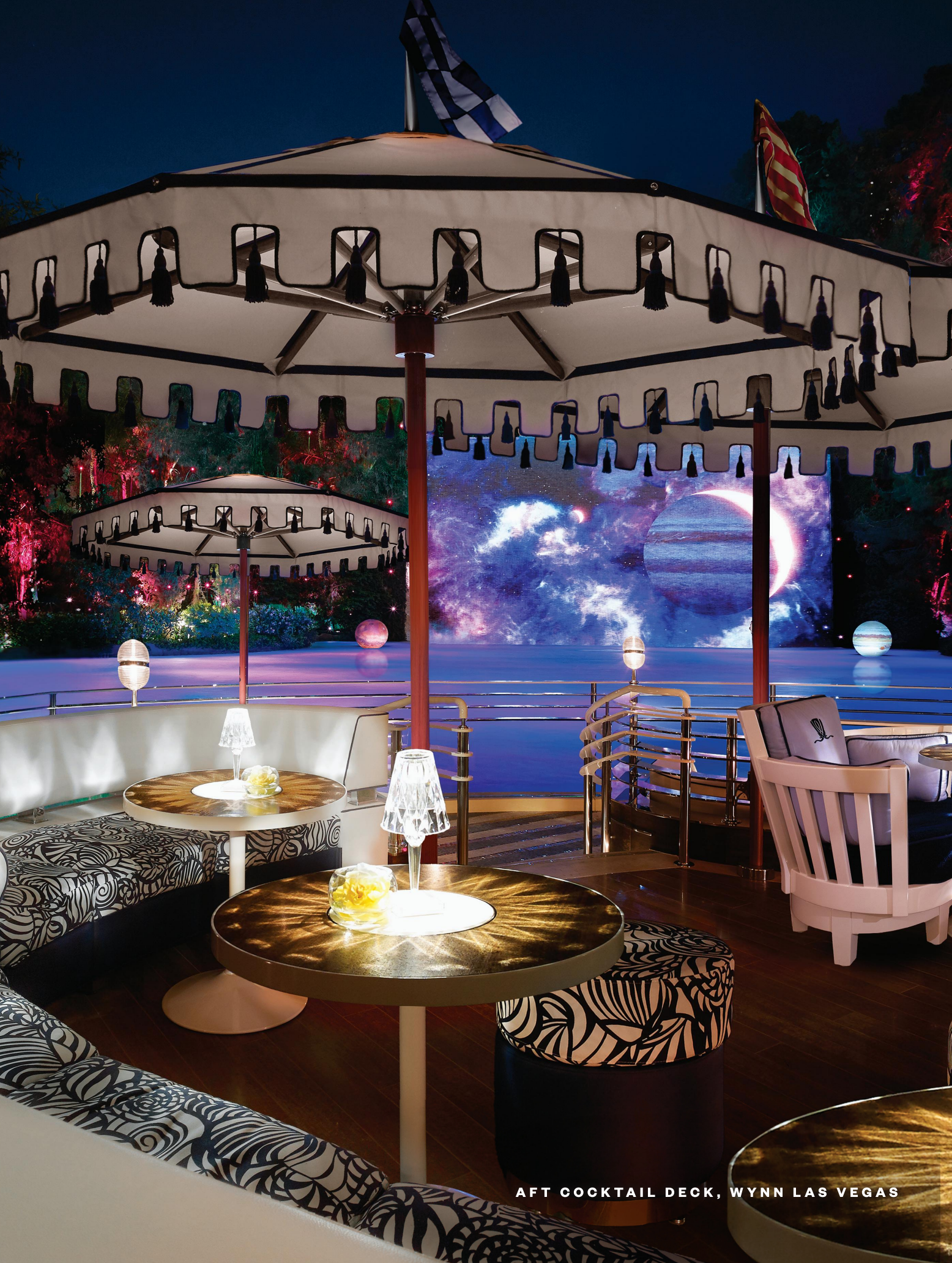
AFT COCKTAIL DECK, WYNN LAS VEGAS