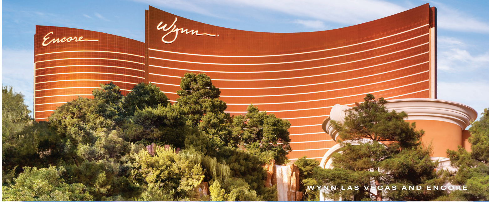
WYNN LAS VEGAS AND ENCORE