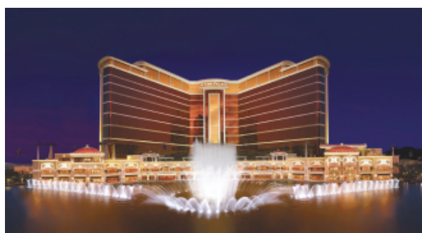
Wynn Palace: Exterior