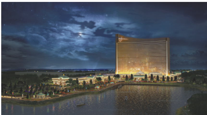
Wynn Boston Harbor: Rendering